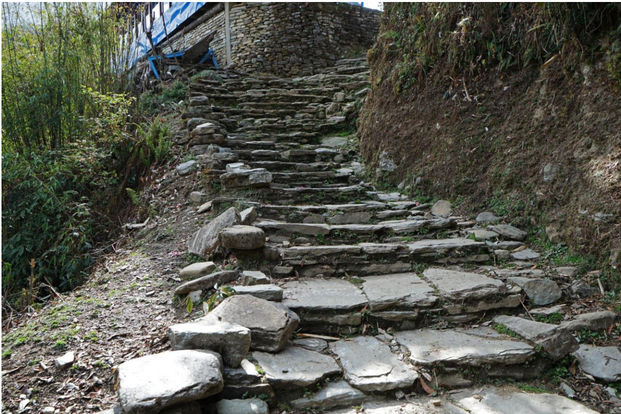
Rocky steps and old building village along trekking to Ghorepani Poon hill

Salest • Meaningful • Experiential Journeys