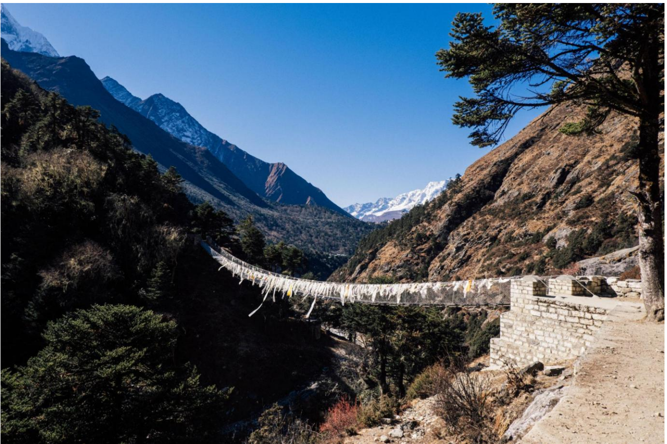
A suspension bridge in the himalaya leading over a deep valley