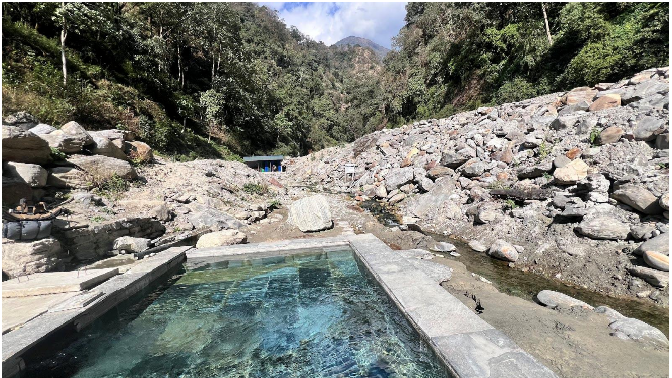
Jhinu Danda Hot Spring located at the Bank of Modi River

Relax in the warm mineral pools beside the river.