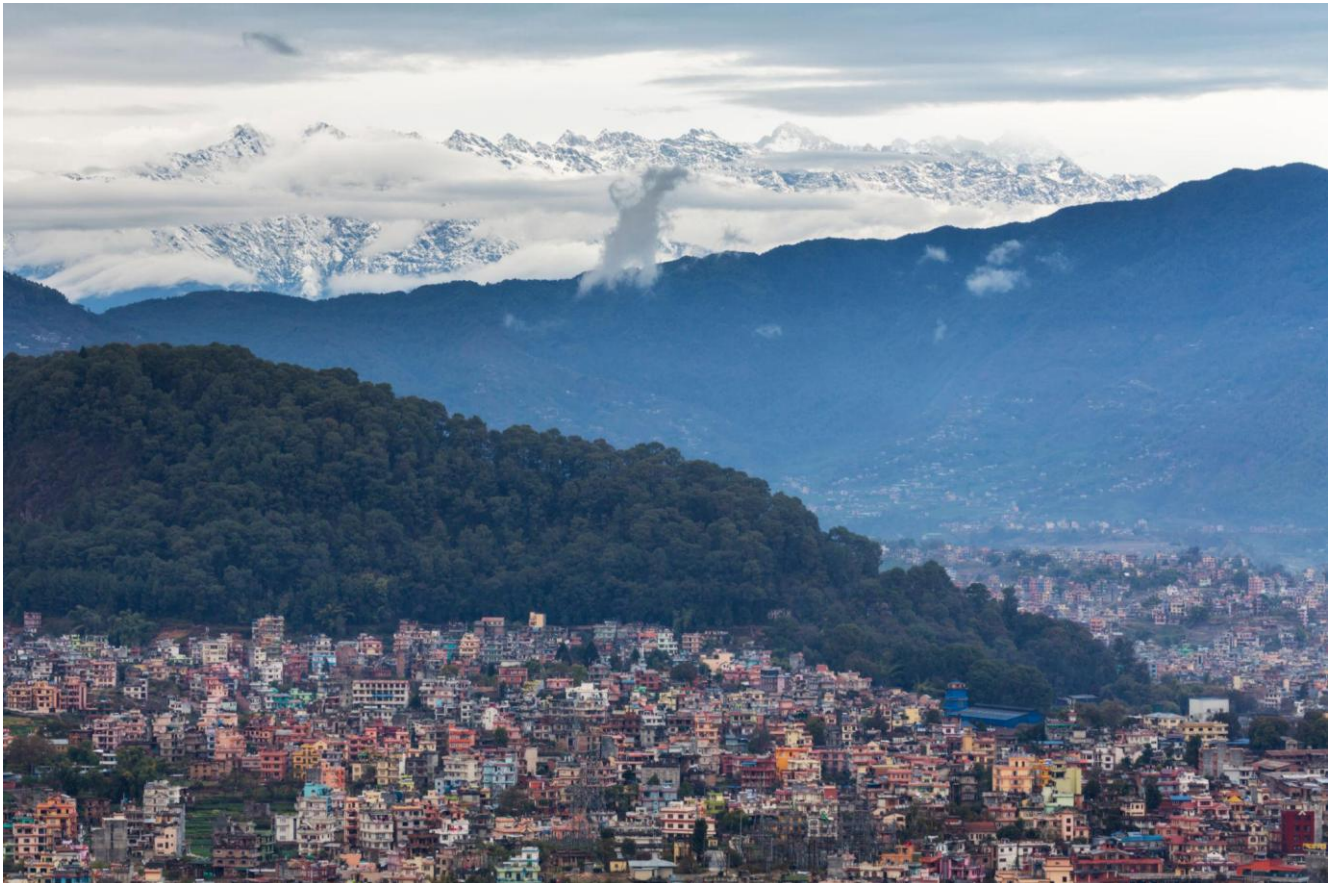
Aerial view of Kathmandu cityscape under mountains, Kathmandu Valley, Nepal

Fly home farewell friends. You are saying goodbye to the mountain as your journey finishes from Nepal. We hope you enjoyed the tour with us, and are sure you will be back in another trip somewhere in the Himalayas again.