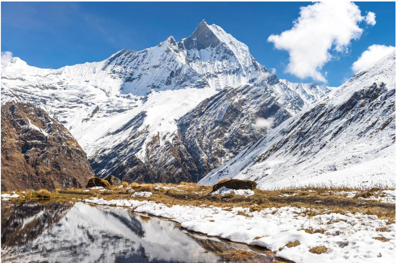
Machhapuchchhre Base Camp Pokhara Nepal / Mount Machhapuchchhre (Fish Tail)