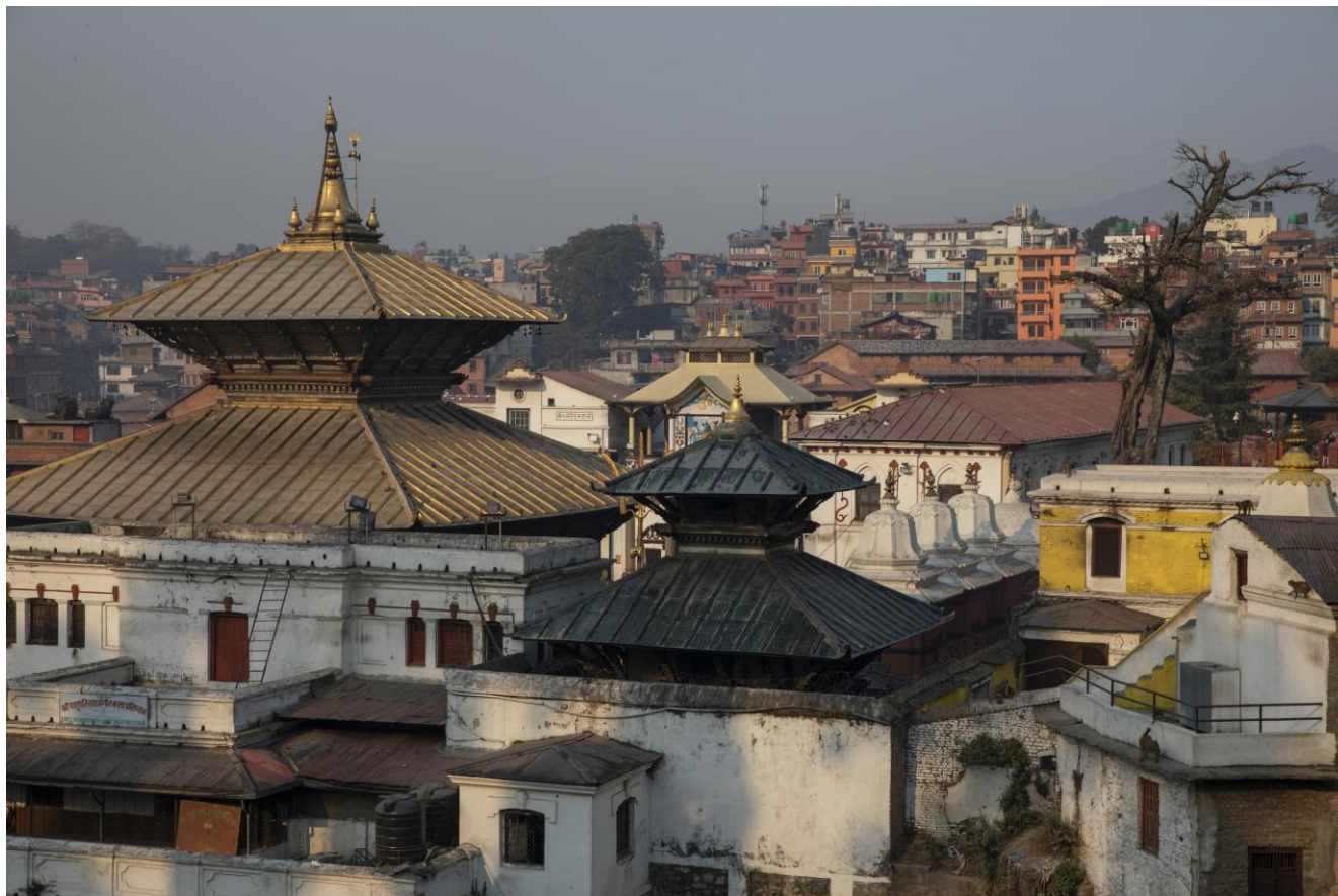
Pashupatinath Temple in Kathmandu Nepal

The rest of the day is free to relax after your international flight or explore nearby streets filled with cafés, trekking shops and lively markets. Meet your trekking guide and prepare for your Himalayan journey.