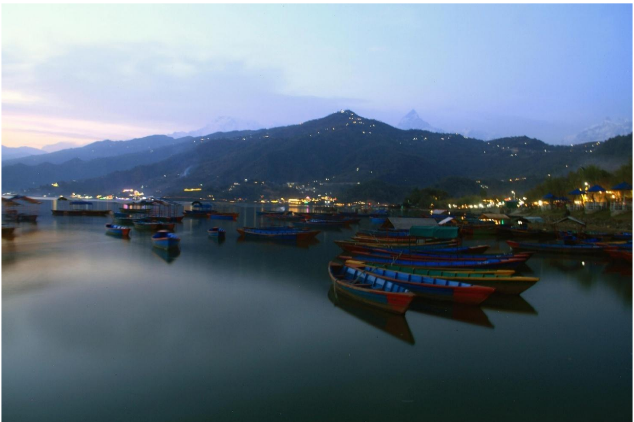
Lakeside Pokhara cityscape at dusk with Machhapuchhre (Fishtail Mountain) in the background.

Pokhara is one of Nepal's most charming towns. In the evening, enjoy a stroll along Phewa Lake , famous for its cafés, restaurants and relaxed atmosphere.