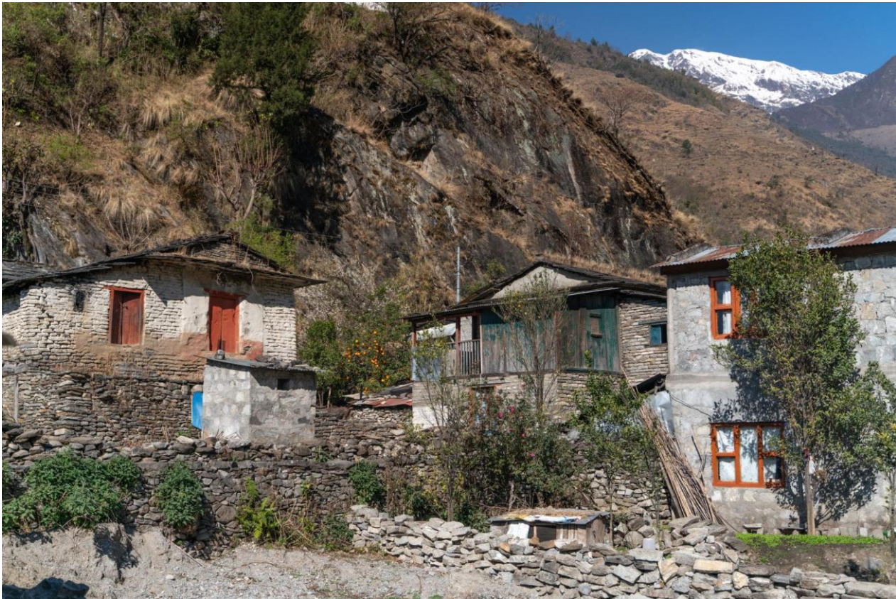
The small village on the Annapurna trail track