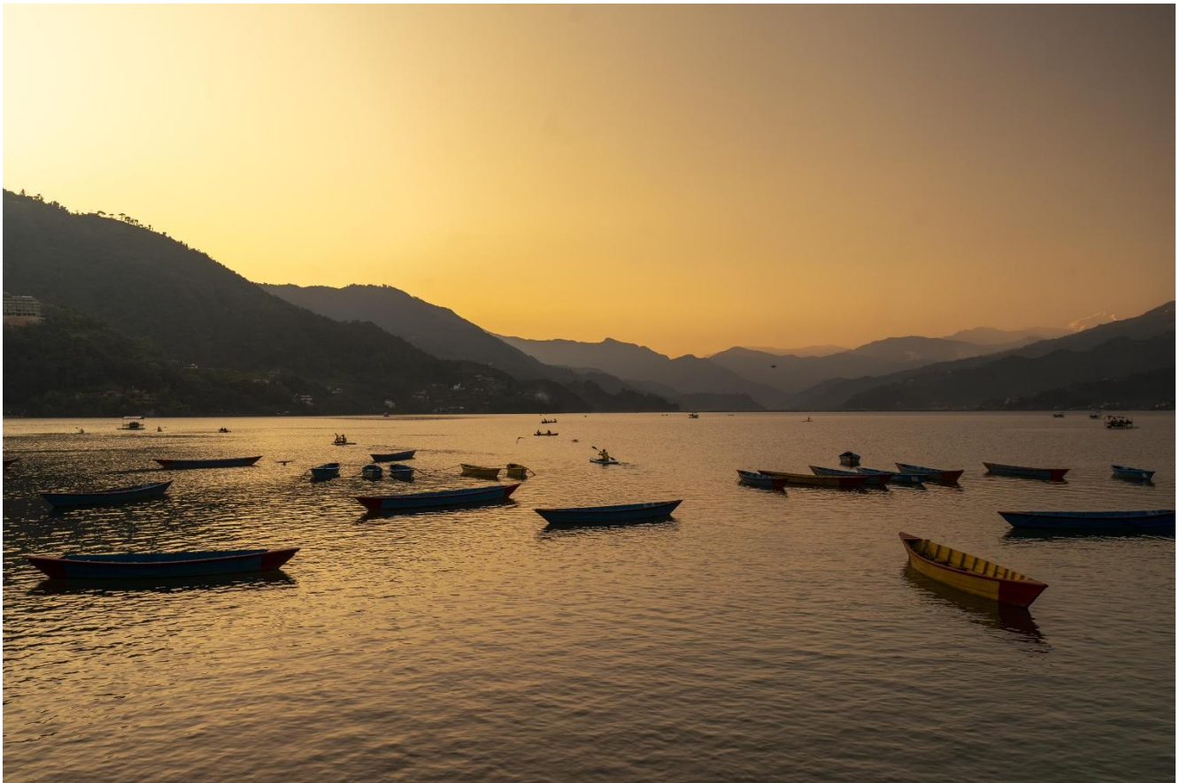
Phewa Lake with boats and mountains at golden sunset.