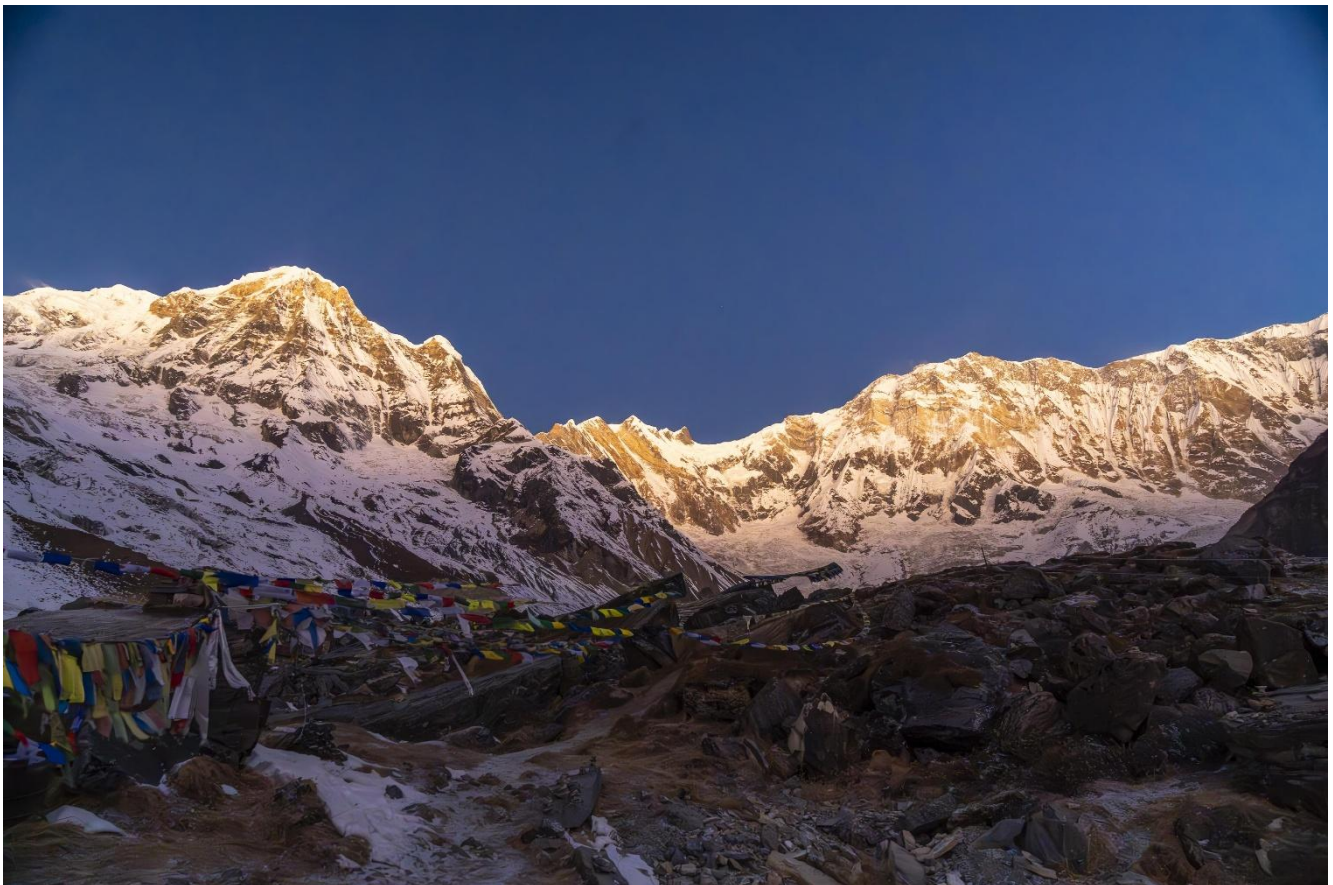
Annapurna Base Camp Himalayas mountains during sunrise

Spend the afternoon exploring and enjoying the magical mountain atmosphere.